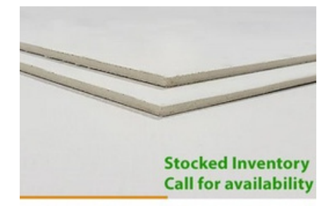
1/8 in MagPanel MgO Magnesium Oxide Board

Panel Dimensions: 1/8" (3mm) x 4 ft x 8 ft Common Uses: Walls & Ceilings Item Number: 808857982612