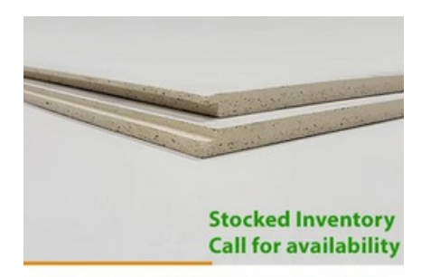
3/4 in MagPanel MgO Magnesium Oxide Board

Panel Dimensions: 5/8" (16mm) x 4 ft x 8 ft Common Uses: Walls, Ceilings & Subfloor Item Number: 808857987419