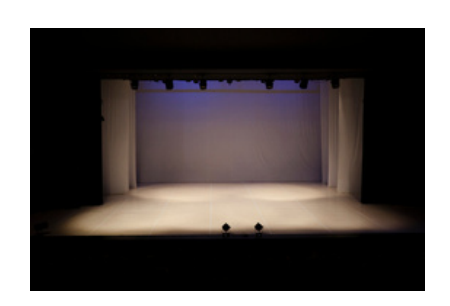
THEATERS & VENUES