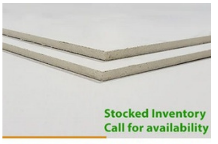
1/4 in MagPanel MgO Magnesium Oxide Board

Panel Dimensions: 1/8" (3mm) x 4 ft x 8 ft Common Uses: Walls & Ceilings Item Number: 808857982612