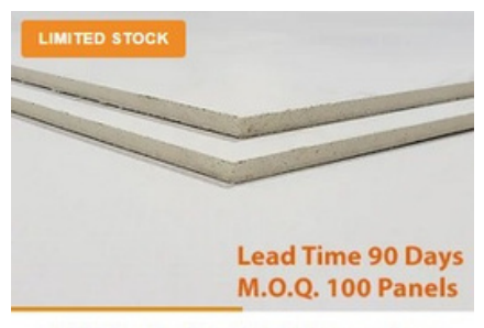
11/32 in MagPanel MgO Magnesium Oxide Board

Panel Dimensions: 1/2" (12mm) x 4 ft x 8 ft Common Uses: Walls & Ceilings Item Number: 691324728536